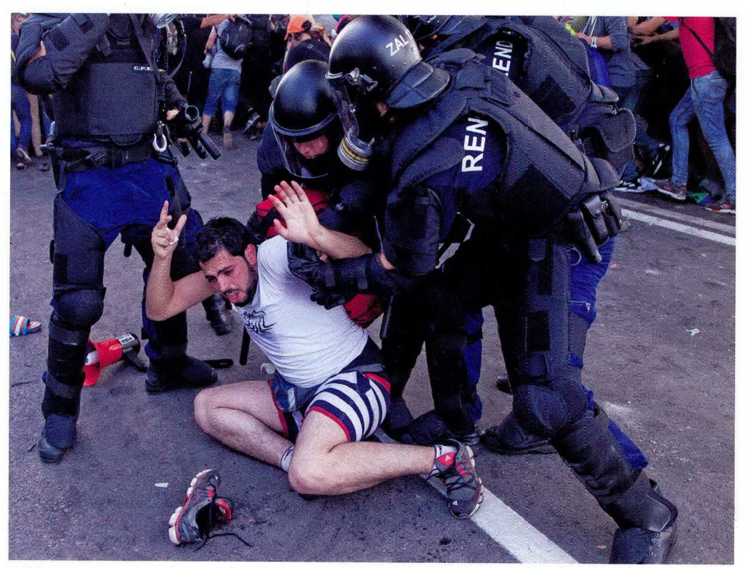
It'll end in tears: police confront migrants in Roszke, Hungary, September 2015

that. Moreover, based on a global comparison of the concessions made to various ethnic groups in terms of rights, autonomy, and power sharing, we found strong evidence that such moves have helped prevent new conflicts and end old ones. By and large, the post–Cold War efforts to stave off ethnic nationalism and prevent war appear to have worked relatively well.